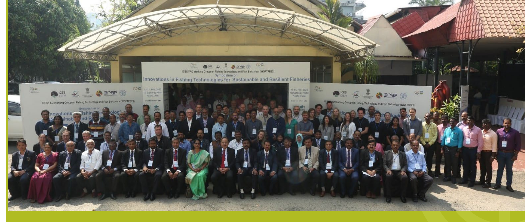
WGFTFB participants at the 2023 meeting in Kochi, India.